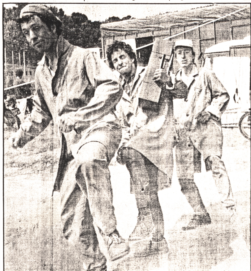
'Bouinax', mad, bad and probably dangerous to know, but they are undoubtedly good to watch.

Archaos will be in Edinburgh in August and London in September.