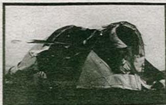
and it'll puff...