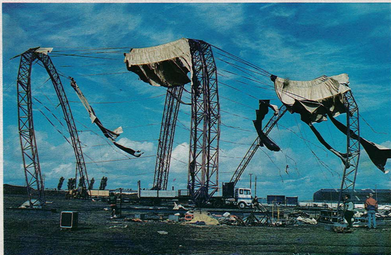
Ain't nothin' goin' on in this tent!