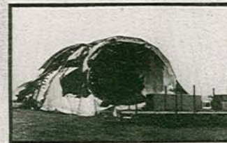
and it will blow your marquee down!