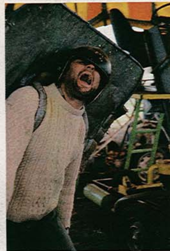
Archaos: at a marquee near you

If it had happened during one of Archaos' anarchic shows people would have probably thought it part of the madness and mayhem going on around them. But, unfortunately for the travelling French circus, it happened the day before they were due to begin their two-week stint in Dublin as part of the currently running theatre festival. An evening of ferocious winds that saw innumerable dogs and cats flying helplessly through the air (with the occasional granny, clinging diligently to the lead, close behind!) proved too much for the specially constructed marquee, erected only earlier that same day.